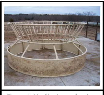
Figure 2. Modified cone feeder.

Both of the Missouri studies and the Oklahoma study indicate that hay waste of low quality forage is clearly greatest with open bottomed feeders compared with cone-type feeders. Using a cone-type feeder may reduce hay waste by as much as 50%. The decrease in wasted hay will more than pay for the additional cost of the cone-type hay feeders.